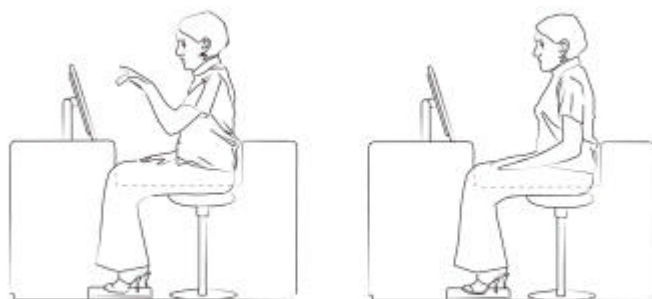
Figure 2: A touchscreen mounted at a seated workstation in a position enabling easy and comfortable access from a neutral posture.